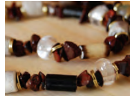
Tiger Eye Style GAC591

Necklace length 48cm and earring length 5.5cm.