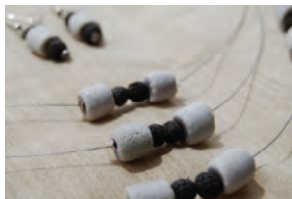
With Recycled Glass Style GAC253