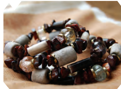
Cats Eye Style GAC351