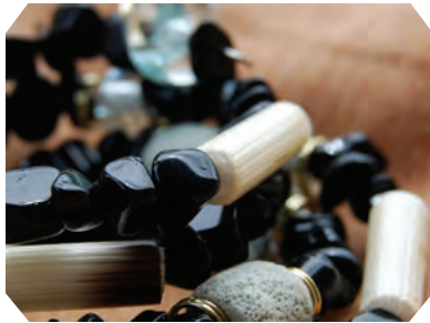
Black Agate Style GAC352

These beautiful wrap bracelets combine recycled glass, porcupine quills and semi precious stone. Compliment the bracelet with a Lefatse necklace or earring pair for a stunning combination.