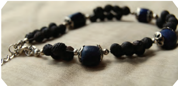
Dark Blue Style GAC330

Intricately patterned, hand-made clay beads are made with mountain clay. The feature beads are made from beer bottles that were crushed and fired, making this a very eco-friendly design.