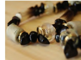
Black Agate Style GAC592