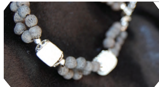
Natural Style GAC331