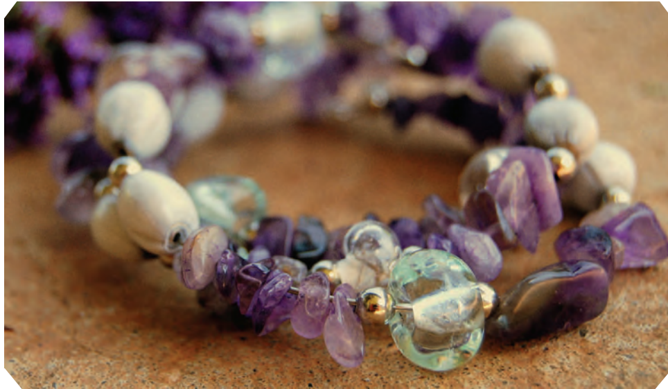
An unforgettable wrap bracelet, the recycled glass, local seeds, and amethyst shine with beauty and wonder. Style GAC321