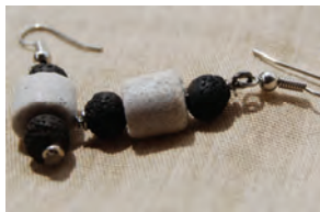
With Job's Tears Style GAC252

Necklace length 50cm. Earring length: 4.5 cm